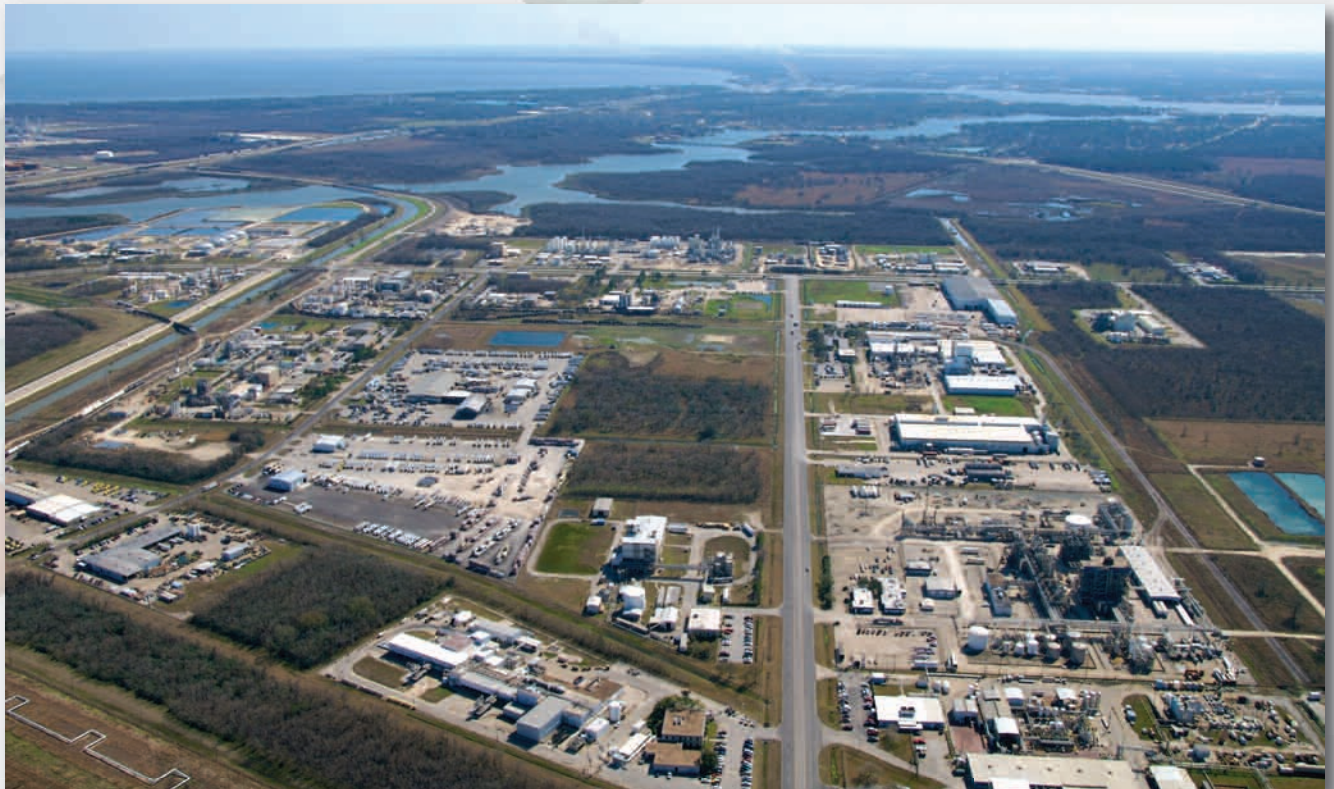
Aerial view of Dianal's facility and the surrounding Galveston Bay area